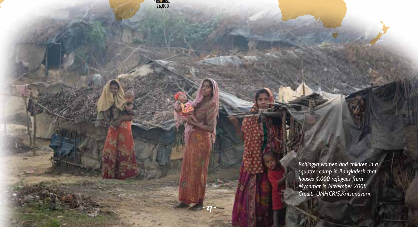
Rohingya women and children in a squatter camp in Bangladesh that houses 4,000 refugees from Myanmar in November 2008.