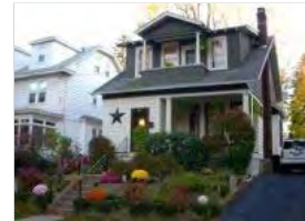
House of the Week: Arts and Crafts in Albany