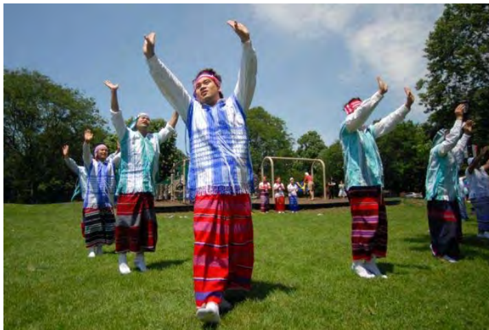
Members of the Karen Cultural Dance Group perform a traditional welcoming song for onlookers at the World Refugee Day Picnic in Washington Park in Albany on Saturday.