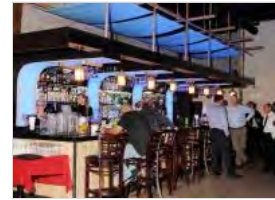
What opened, what closed

"This is more than a new home," he said. "This is the future for my children."